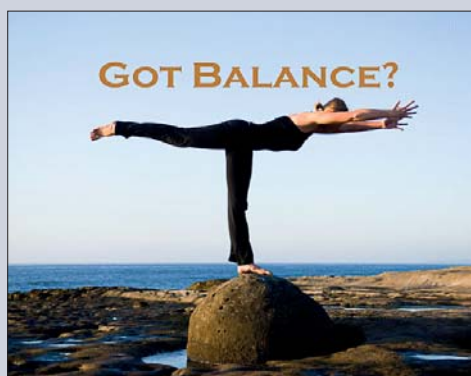
Figure 3: BALANCE – Balance is critical to finding lasting Happiness. It occurs when all important aspects of your life are in harmony. Most important is knowing your Essence and applying it to make this a better world.

after that is usually a measure of your professional "progress." Besides, there are literally hundreds of examples which show that financial success often follows from pursuit of your Purpose and Passion in life. I can personally attest to this. Every professional pursuit I have followed was based on my personal Essence and Passion . And each time I achieved more emotional and financial success than I might ever have imagined at the outset – even when in some instances "experts" assured me that there was no way I could succeed.