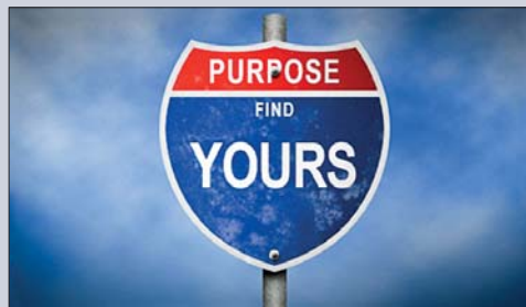
Figure 1: PURPOSE – You can find that fundamental Essence that separates you from others. And when you connect it with a need in the world that makes it a better place, you will have found your Life Purpose and long-lasting Happiness.

administration. I've done the science stuff. It's time for me to move up in the world," he would proclaim. When finally placed in that position, he became utterly distraught and asked management to send him back to the lab. When they acquiesced, he finally recognized his true sense of purpose and passion. He was genuinely happy! In his re-discovered sense of purpose and fulfillment, he continued to make creative and successful technological contributions for which he was handsomely rewarded financially by the company, and psychologically by adulation from his peers and his personal satisfaction!