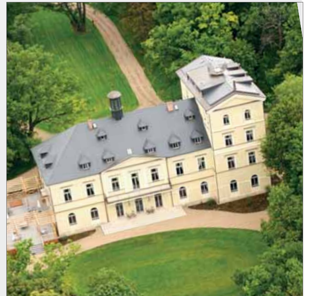
Figure 4: Chateau Mcely: International award-winning, castle hotel, spa and forest retreat

Over dinner, one of my colleagues told this gentleman about my prior career in music. The gentleman suddenly exclaimed, "Now I know why you look so familiar; I saw you several times some years ago on Dick Clark's American Bandstand TV Show. That's just fantastic! Would you be willing to sing for our annual venture party?" The next day his company contributed 50% of our funding and both venture groups agreed to our 20% higher valuation.