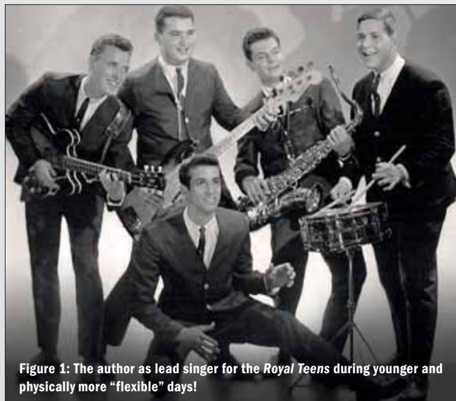
Figure 1: The author as lead singer for the Royal Teens during younger and physically more "flexible" days!

You are eminently capable of finding that special part of your body, mind and spirit that distinguishes you from all others in your professional and personal circles – that unique "something" which gives you sheer pleasure and has the potential to generate great value for both you and the world. That "something" is nothing less than your true