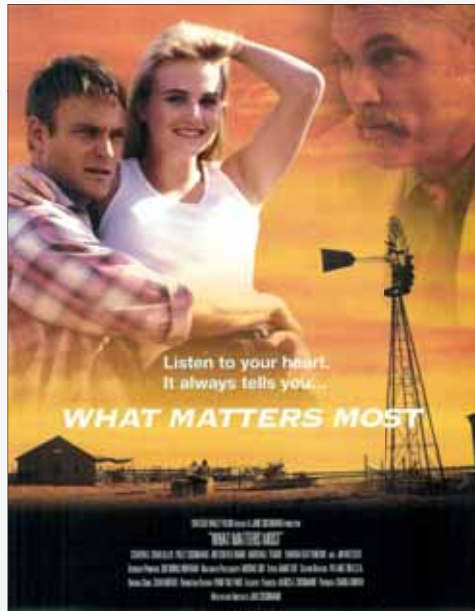
Figure 3: Movie poster for "What Matters Most," award winner at numerous film festivals, released in over 45 countries.